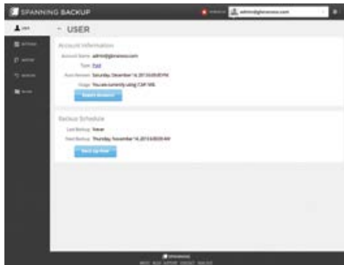
Backup options for everyone.