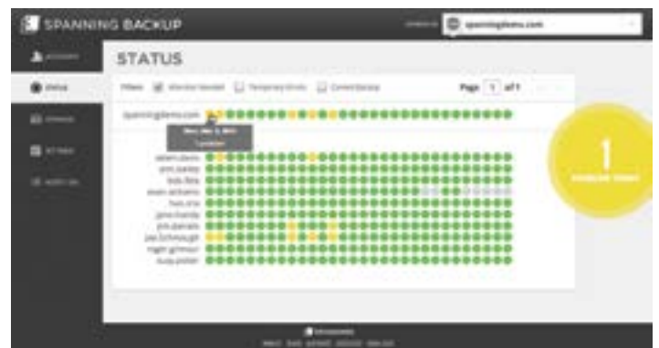
Finally - honest status updates you can trust.